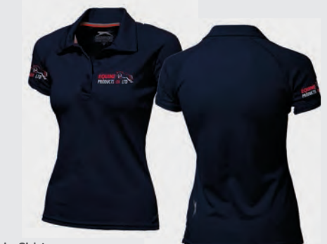
Polo Shirts 100% Polyester three button pol shirt. Available in Ladies and Men's Small/Medium & Large.