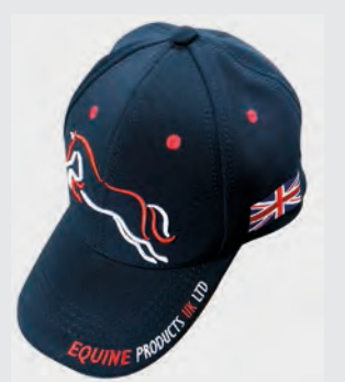
Baseball Hats 100% polyester and one size fits all with adjustable Velcro closing.

Heavyweight UltraSoft Peach Finish fabric. 3 panel waffle lined fabric hood with Ecru flat chunky hood cords. Kangaroo pouch pocket with concealed iPod and phone pocket. Available in Small/Medium & Large.