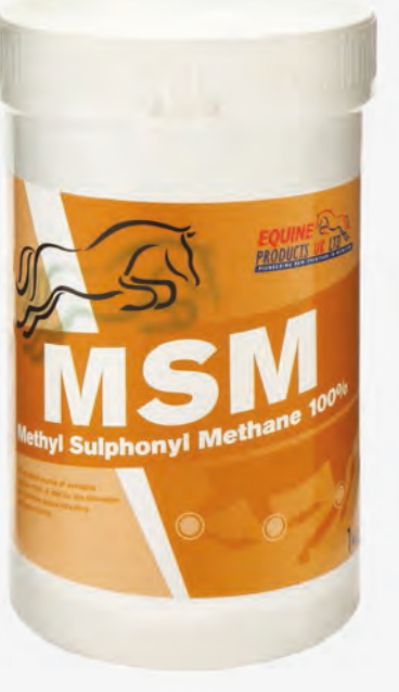
1kg Tub (200 Measures)