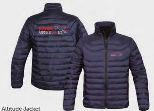
Altitude Jacket Durable water repellent outer shell with a thermal insulated shell. Available in Small/Medium & Large.